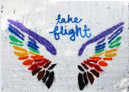
GLBT History Month, October 2019