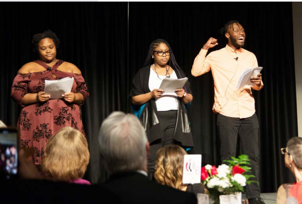
Sisterhood Dinner, Feb. 24, 2020

Due to COVID-19, we recognized our students virtually this year. In place of Lavender Graduation, the GLBT Center created a virtual yearbook. Multicultural Student Affairs also created a virtual yearbook in place of Multicultural Graduation. We look forward to resuming in-person celebrations in the future.