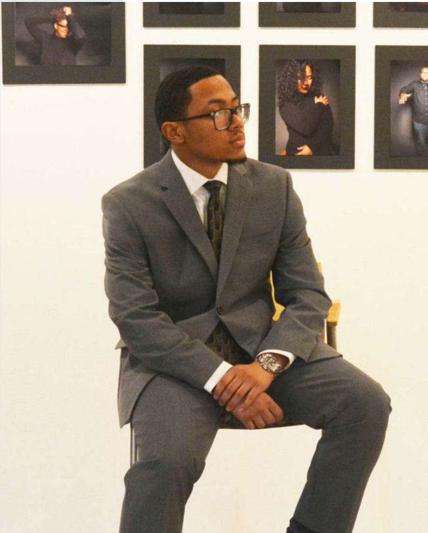
Blacks in Wax, Feb. 22, 2020

In 2019-20, the following OIED programs and initiatives supported this core area to foster the success of each of our broad communities.