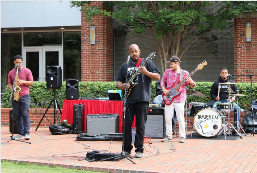
AfroPack Oct. 19, 2019

In 2019-20, the following OIED programs and initiatives supported this core area to help strengthen our students' successful journey to, through and beyond NC State.