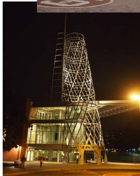
Winslow Hall (above), Talley Student Union (left), two of OIED's campus homes