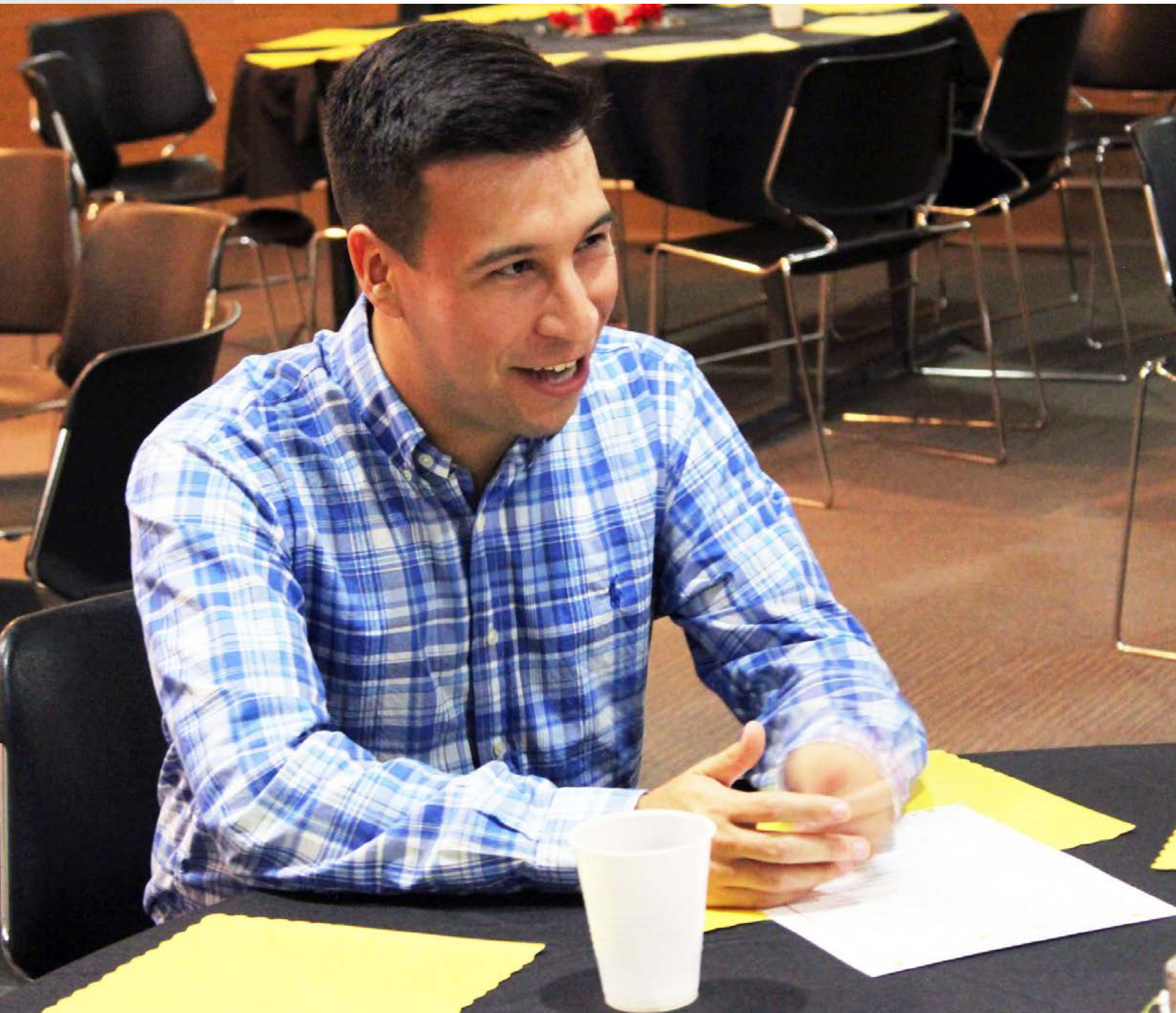
Association of Latino Professionals For America Event, Oct. 22, 2019