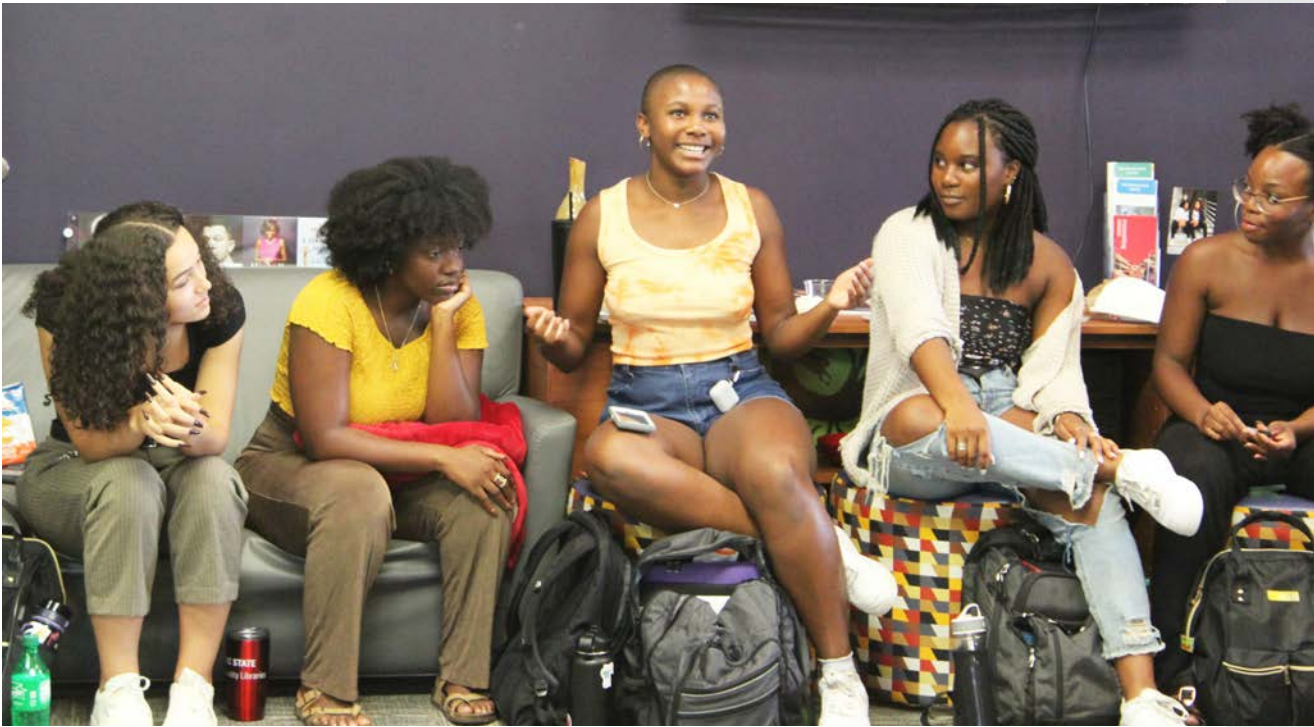
African American Cultural Center What's on the Table? Sep. 27, 2019

regularly via a volunteer newsletter to 400 subscribers. Volunteers perform a range of duties within the center, from assisting with tasks and duties within the center to assisting with events.