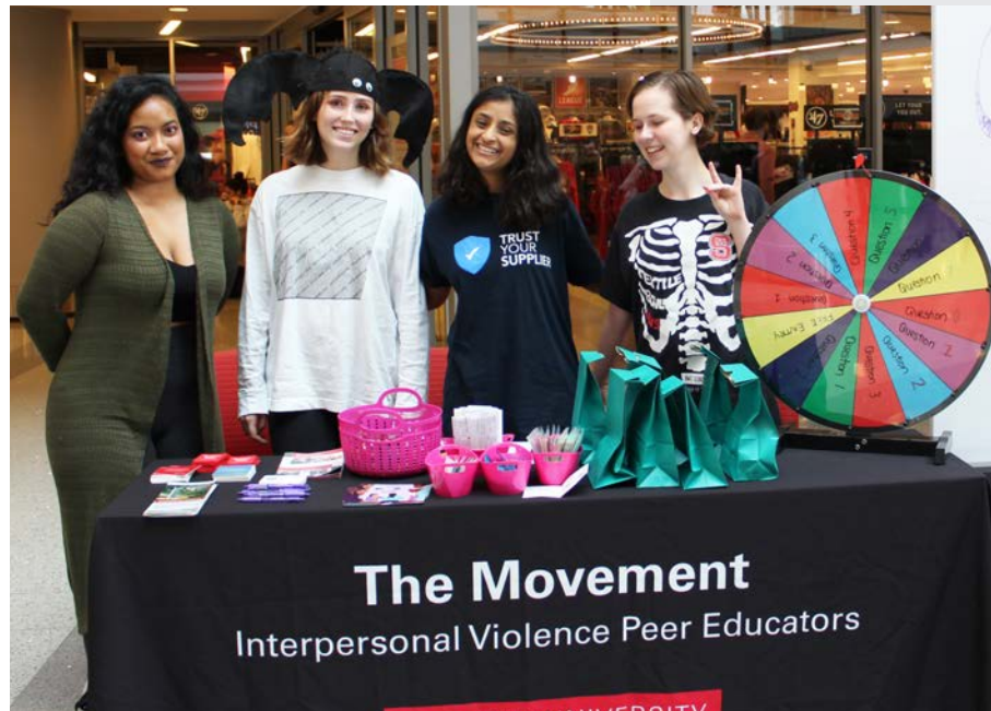
The Movement, Oct. 31, 2019

In fall and spring, the GLBT Center hosted retreats with LGBT-identified student organization leaders in which we discussed campus climate, leadership development opportunities and assistance with student organization logistics, such as identifying an advisor. The two retreats engaged 48 total attendees.