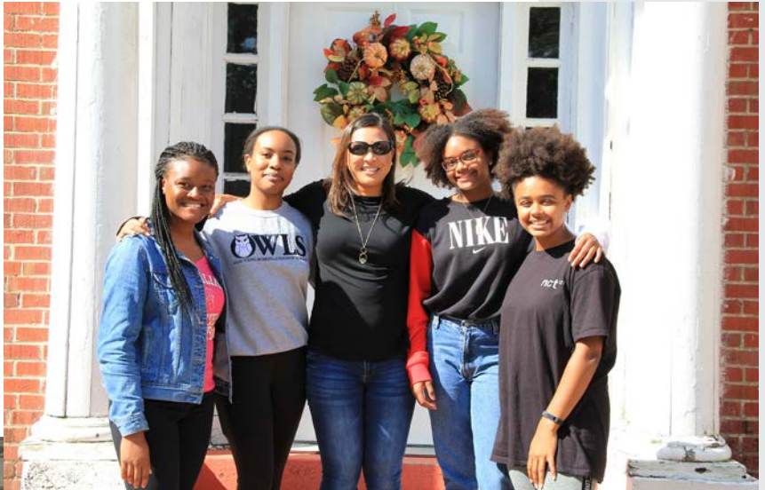
Womxn of Color Retreat October 2019