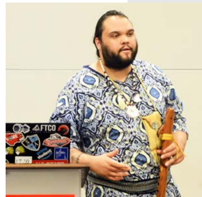
Native American Culture Night November 2019