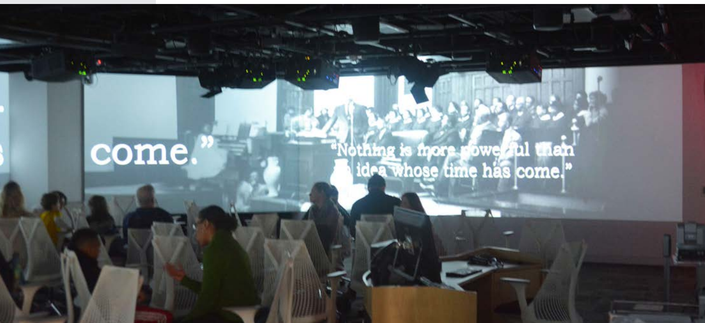
Virtual Martin Luther King Jr. Project, Hunt Library, Feb. 15, 2020

In the following pages, we provide annual updates on all of our programs and initiatives, grouped corresponding to the outcomes of our new model.