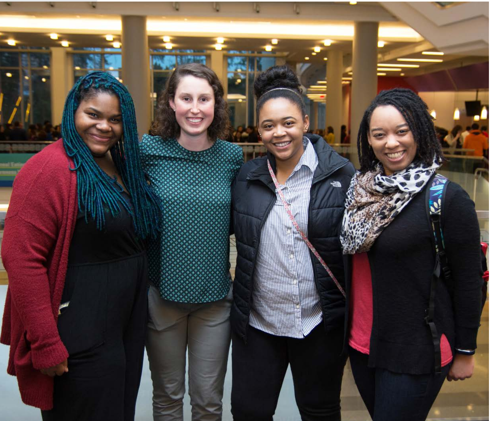
NC State University's Annual Sisterhood Dinner, Feb. 24, 2020